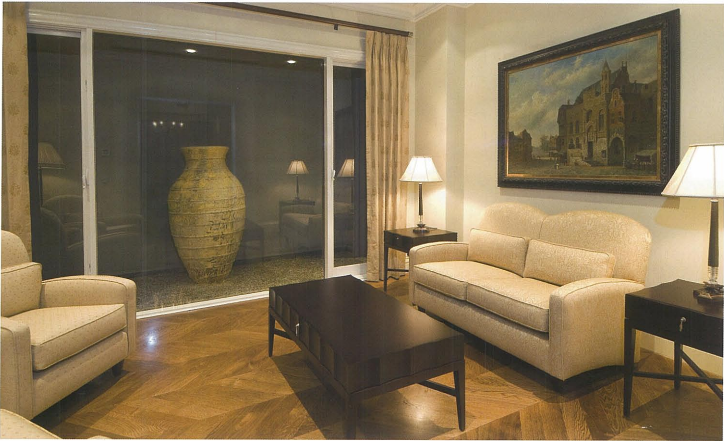
Above Coffee and lamp tables in dark hues are enhanced against a neutral palette. Left Dark cabinetry gives this bathroom a chic, clean effect. Opposite page Antique marble benchtops and solid wood cabinets make up this stunning kitchen.